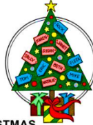
CHRISTMAS GIVING TREE

Christmas For Back Pack Pals Christmas is upon us so it's time for Christmas for backpacks. We need 16 cloth grocery type bags, not the smallest but those with a rectangular bottom. We will be placing a small box of cereal, a small jar peanut butter, a small box of poptarts, several protein items that are light weight (mac & cheese, noodle bowls, etc.) snack items that are notorious. We will need to pack by December 15. Thanks for anything you choose to do. May leave all items in food room on backpack side.